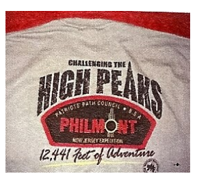
PPC EXPEDITION BASE CAMP T-SHIRT $15.00