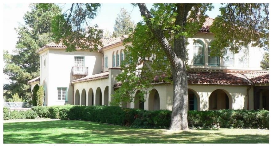
The Villa Philmonte, at Philmont, was Waite Phillips' summer home. It is located across the road from Camping Headquarters. Have your Ranger help schedule a tour and earn the Villa patch while you are in Base Camp.

<u>Search:</u> Having trouble finding information on a particular topic? You can search for it by keyword(s).