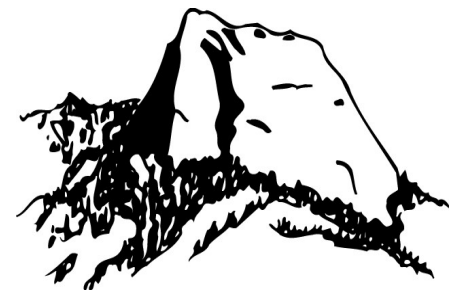
The Tooth of Time